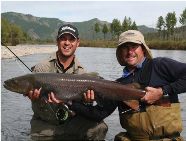
Happy fly fishermen make a big catch.

Anglers will also have the opportunity to fish for the Asian trout, lenok. Lenok are reputedly one of the oldest trout species in the world. They tend to inhabit the shallow riffles and flats near shore, where they are sheltered from the taimen and can gorge themselves on grasshoppers, crickets, and insect hatches. We'll follow local guides to prime fishing spots and wet our flies in the pristine waters of the Eg or Üür River, hoping to net one of the area's large taimen. Due to our strict catch-and-release policy, all of these magnificent fish are released unharmed so that their populations may continue to thrive. Take a break for lunch out on the river, and enjoy a full afternoon of stalking the mighty taimen. Return to the camp for dinner this evening.