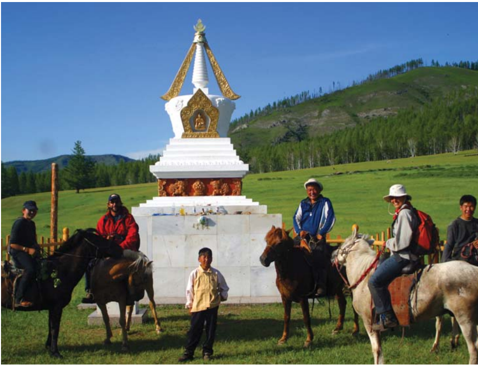
Travelers en route to the Dayan Derkh Cave.

For more information or to reserve your place on this expedition, please call Jonathan Mostoller at Frontiers Travel: 1-800-245-1950.